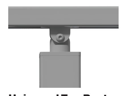
Universal Top Post